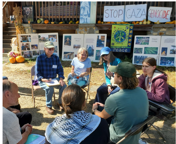
Francis Day Small Group Discussion

At St. Francis Day on October 4th, we attempted to locate the grief, and despair of our collective lives. We created a space for silence, listening, prayer, and song, in “A Call to Resistance.” Two hundred searching souls journeyed to Hardwick’s Nipmuc woods to explore faith-based nonviolence and noncooperation. Together, we found courage to confront the national choke hold of a demagogue.