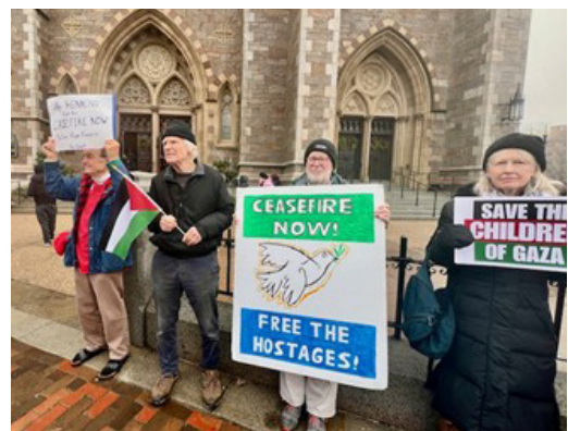
Vigil at Cathedral of the Holy Cross, Boston