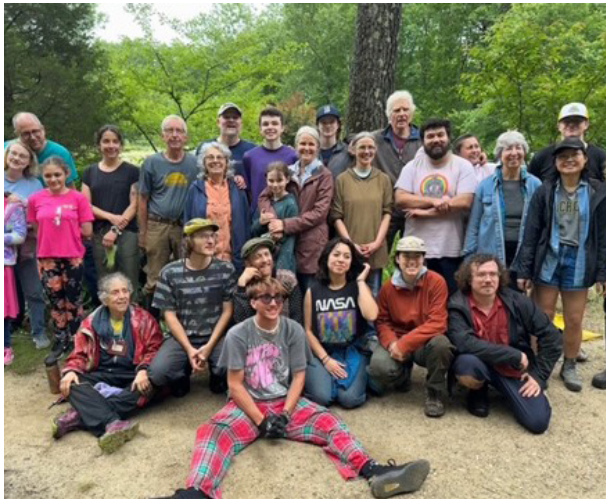
June Agape Workday Volunteers

harvesting arugula, Asian greens, turnips, kale, black and daikon radishes.